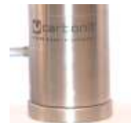
SANUNO inoxF with bottom

Further informations, expert assessments, certificates and up-to-date developments can be found online at www.carbonit.com .