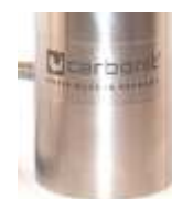
SANUNO inoxS standard